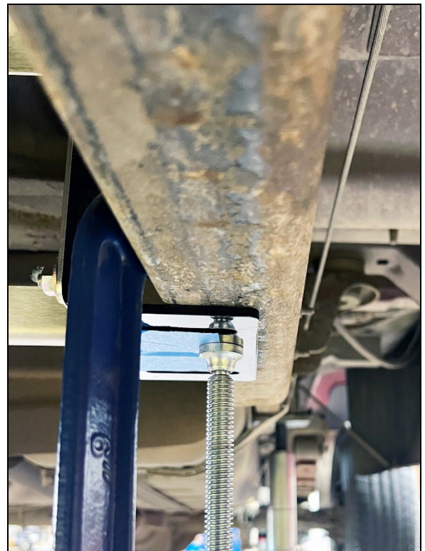
INSIDE / BRACKET EXTENDED AWAY FROM FRAME

NOTE: E-Brake cable should run through a split hose or sleeve, and not be pinched, if behind bracket.