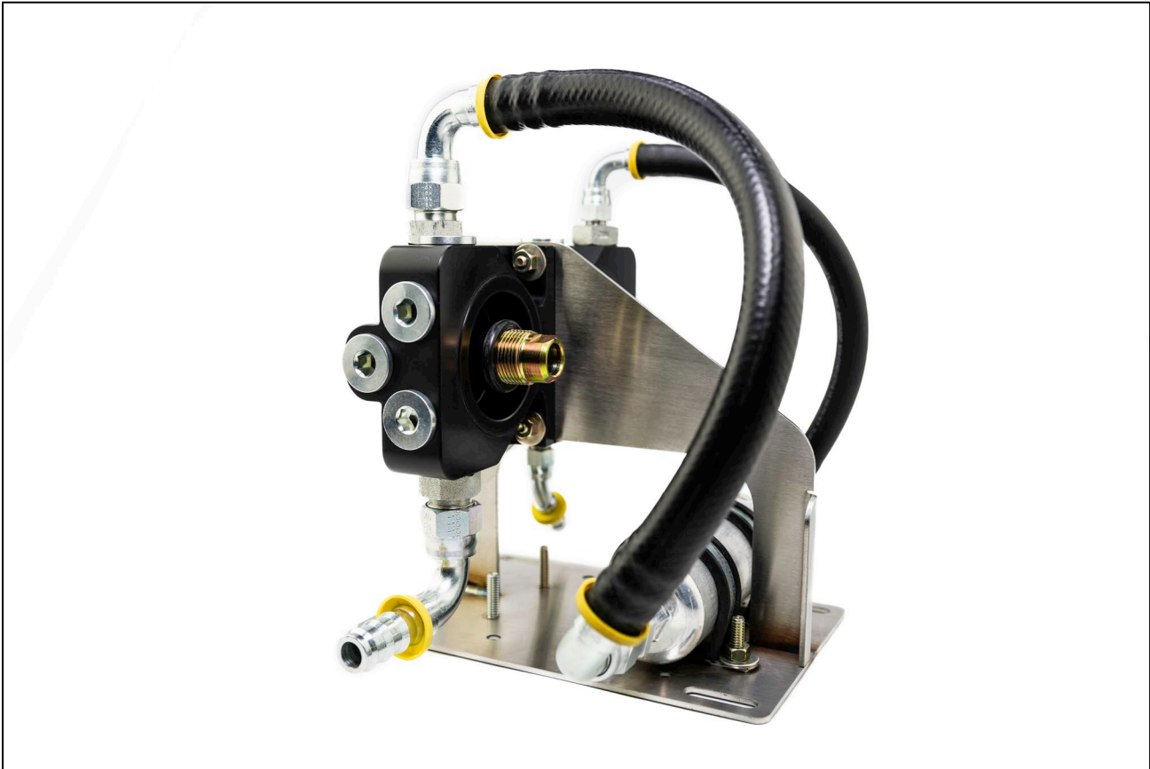
Figure 3 – Pump Inlet View – “Inside the Frame” Orientation