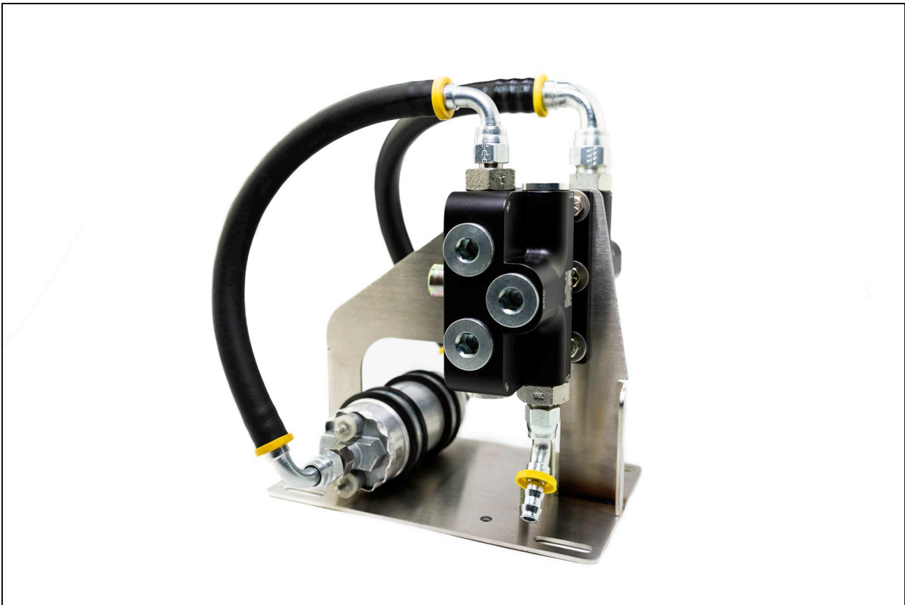
Figure 4 – Pump Outlet View – “Inside the Frame” Orientation