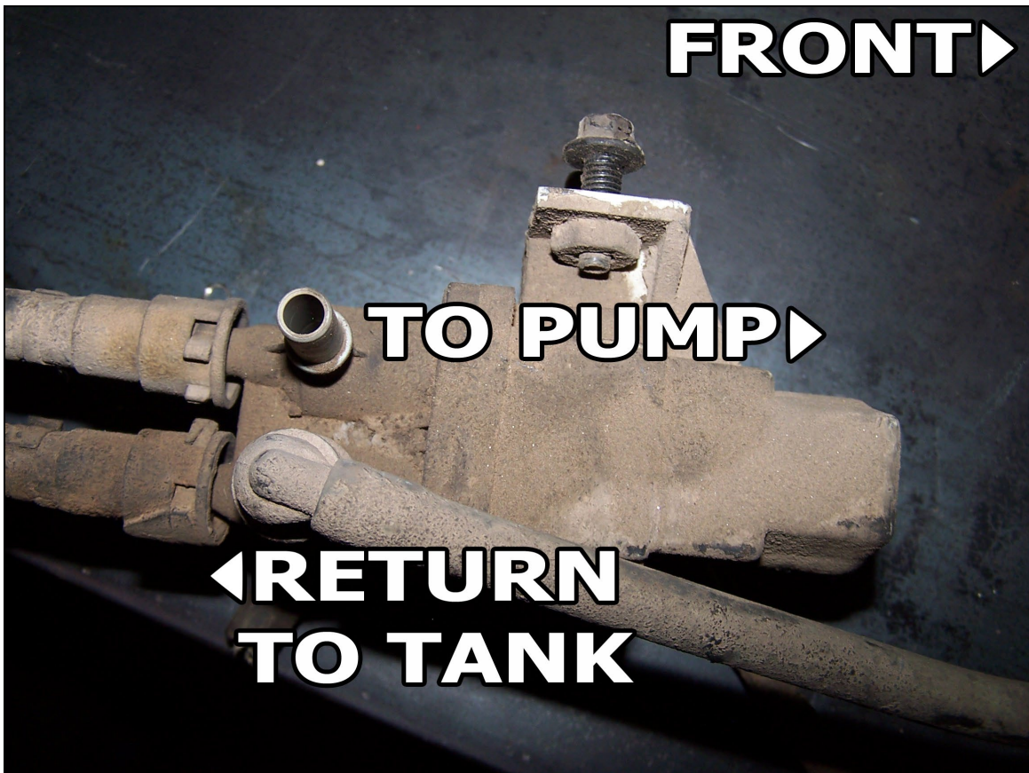
Figure 5 – Fuel Tank Selector Valve – RETURN HOSE Identification