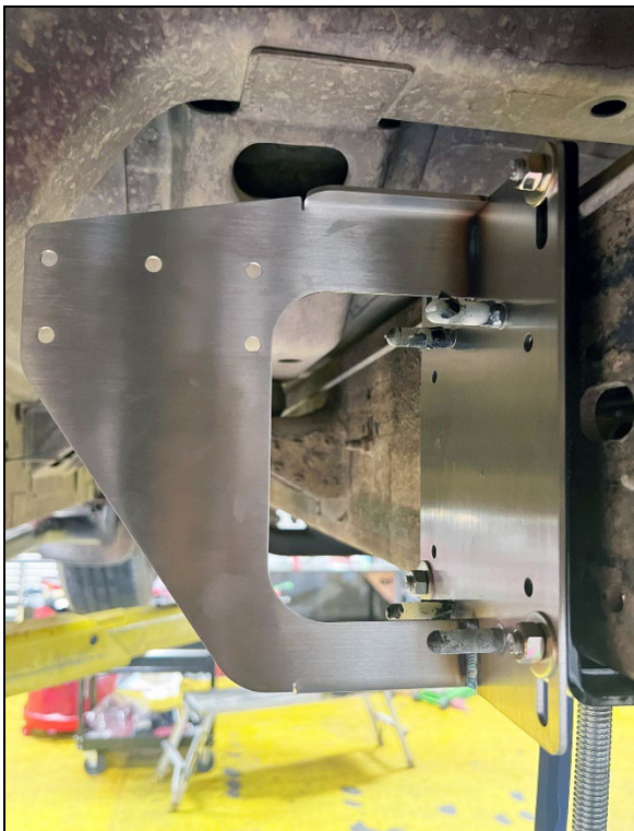
OUTSIDE / TIGHT TO FRAME / LOW POSITION