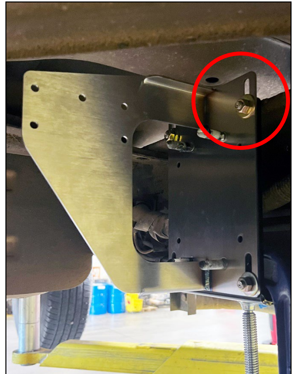
INSIDE / TIGHT TO FRAME / HIGH POSITION